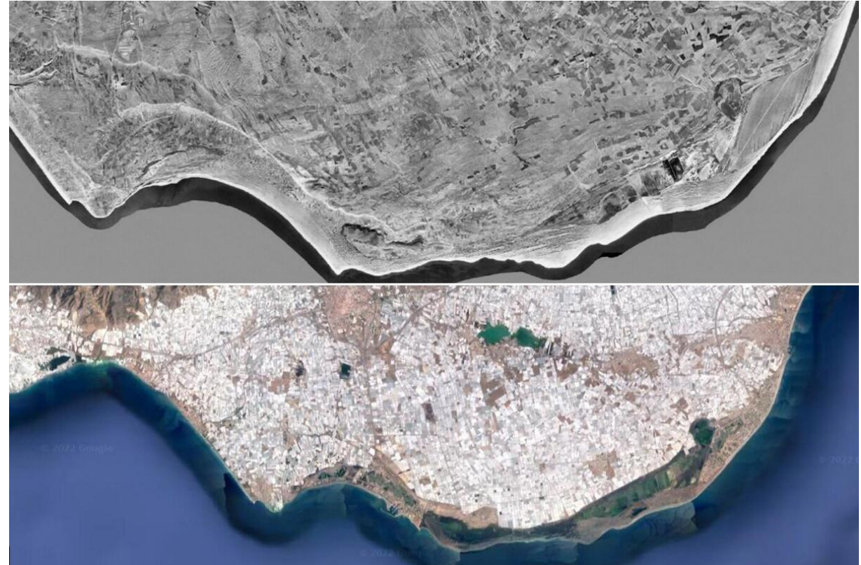
Province of Almeria (Spain) 1960-2020

According to Eurostat Spain & Italy produce about 45% of the total production of fresh fruits and vegetables thanks to their industrial sector